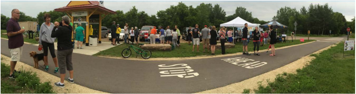
Above: Community members gather to celebrate the completion of the Brown's Creek Trail in Stillwater.