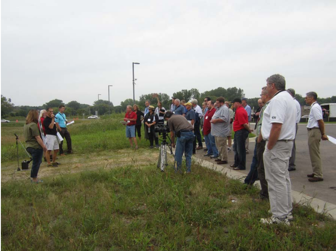
Above: Decision makers in the Forest Lake area learn about stormwater projects, issues and opportunities at a workshop led by EMWREP and Minnesota Extension.