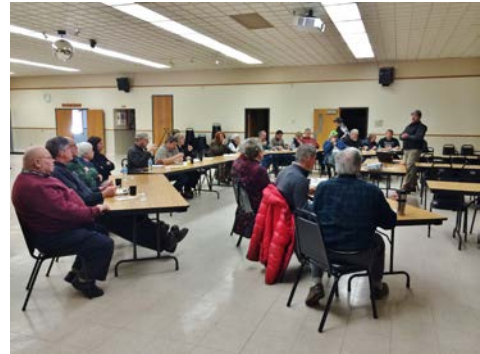
Above: Rural landowners in Scandia learn about new conservation grant programs.

Evaluation: During 2015, EMWREP did not conduct any audience research with rural landowners. Previous focus groups and surveys have indicated that rural landowners in our area are interested in creating and improving wildlife habitat on their land and managing invasive species, so we have modified our outreach to highlight the connections between habitat and clean water.