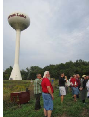
Right: Decision makers in Forest Lake visit a stormwater treatment facility.