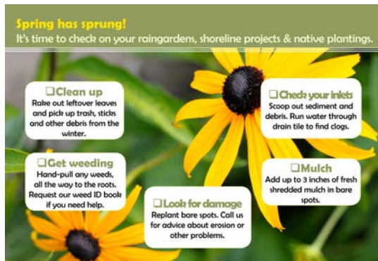
Left: Postcard mailed to properties in the new BMP data base.

Newspaper articles: EMWREP contributed 73 press releases and news columns to 18 area newspapers in 2015. Angie Hong’s news columns (indicated in italics in the list below) are published weekly in the Valley Life edition of the Stillwater Gazette and bi-weekly in other area newspapers. Read them on-line at www.eastmetrowater.areavoices.com .