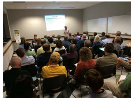
Above: Lake Association members learned about aquatic invasive species at a meeting in September.