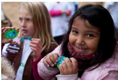
Woodbury Girl Scouts show off their new service event badges.

Girl Scouts 100 Year Anniversary Events: EMWREP helped Girl Scouts of the River Valleys' to plan community clean-ups for clean water to celebrate their 100-Year Anniversary. In the East Metro, Girl Scouts organized clean-ups near Forest Lake, Big Marine Lake, Square Lake, White Bear Lake, Lake Phalen, Beaver Lake, and at Ojibwe Park in Woodbury and Hamlet Park in Cottage Grove. Region-wide, girls marked 6,872 storm drains and distributed 50,000 door hangers. To learn more about the event, go to www.girlscoutsrv.org/about-us/girl-scouts-centennial/centennial-day-of-service .