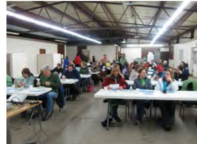
Above: Horse owners learned about protecting water resources.

Buckthorn Workshop: Held in Afton on April 5, this workshop provided residents with information about controlling buckthorn, replanting with native plants, and controlling runoff and erosion on wooded properties.