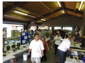
Hundreds of people attended RWMWD's WaterFest at Lake Phalen.

Student Programs: EMWREP participated in the following children's education events: