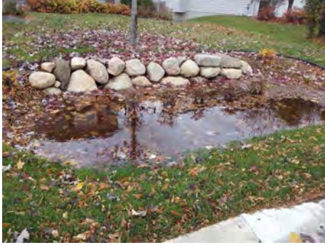
Above: One of the new Colby Lake raingardens shortly after planting.

Targeted neighborhood outreach: Last year, shared education staff conducted targeted outreach in Lake Elmo (VBWD), Stillwater's Lily Lake neighborhood (MSCWMO), and Woodbury's Powers and Colby Lake neighborhoods (SWWD). Outreach activities included mailings, open house events and door-knocking. As a result, 50 new stormwater retrofit practices will be installed in these four neighborhoods: