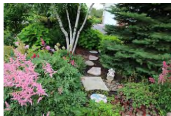
The Grabowski home in Lake Elmo (VBWD) was featured on the St. Croix Valley Garden Tour.