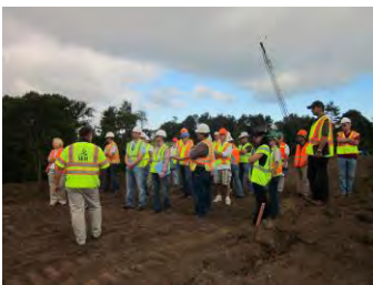
City staff and contractors visited an active construction site in Cottage Grove.

Erosion Control Field Seminars: On August 9, EMWREP collaborated with the Minnesota Erosion Control Association to