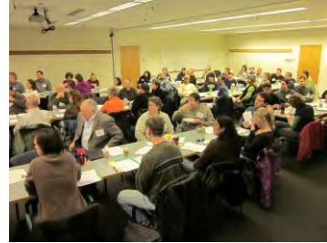
The first set of workshops focused on design principals