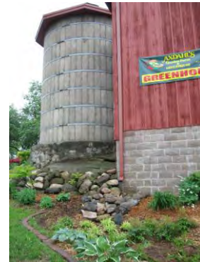
Axdahl's Garden Center worked with BCWD to build two raingardens and then hosted a Blue Thumb workshop.

Community Events: EMWREP reached around 300,000 people at local community events and Blue Thumb partner events.