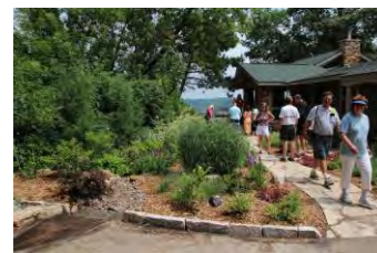
The Zemcuznicov home in Stillwater (BCWD) was also featured on the tour.