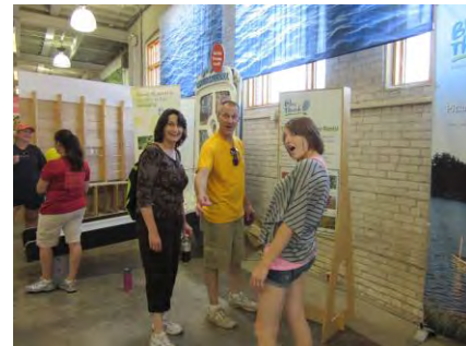
Visitors at the State Fair were amazed by the lengths of native plant roots.