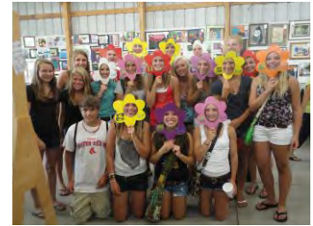
Friends pose as native flowers at the 2011 Washington County Fair.

Student Programs: EMWREP participated in several water education programs during 2011 for K-12 students: