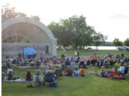
The Artful Raingardens Exhibit kicked off with a performance by Heart of the Beast Puppet theater.